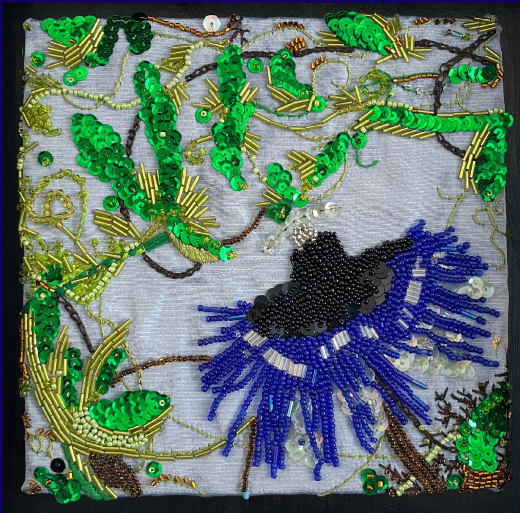
Eden - 2023

20x20 cm - satin, polyester, glass pearls, sequins