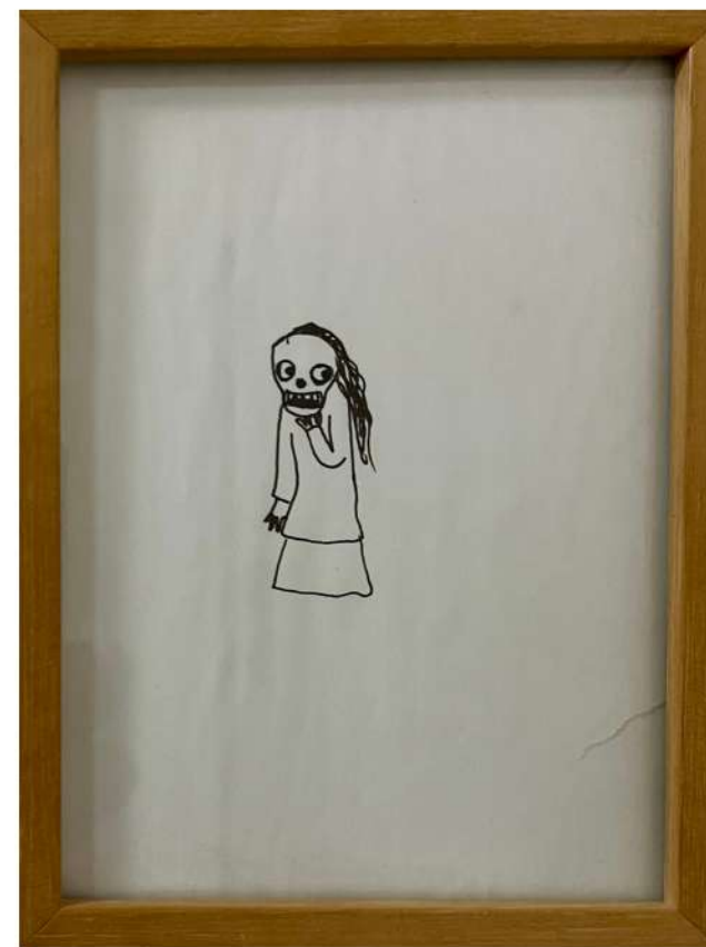
sans titre - 2023