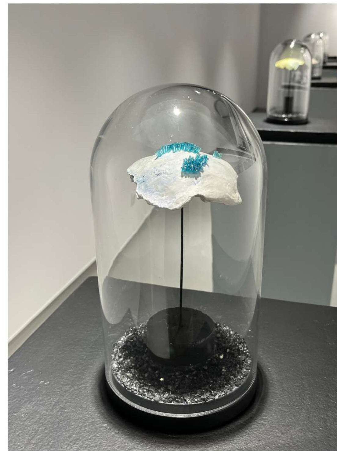
Sea bones (E) - 2024

41x37cm - mix medias (pearls, cellulosic ceramic, glass...)