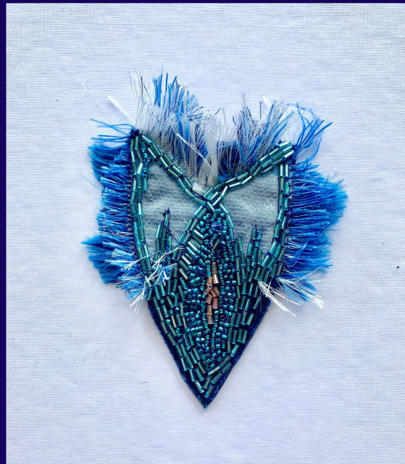
Power Meow - 2023 - private collection

20x20 cm - satin, polyester, glass pearls, sequins