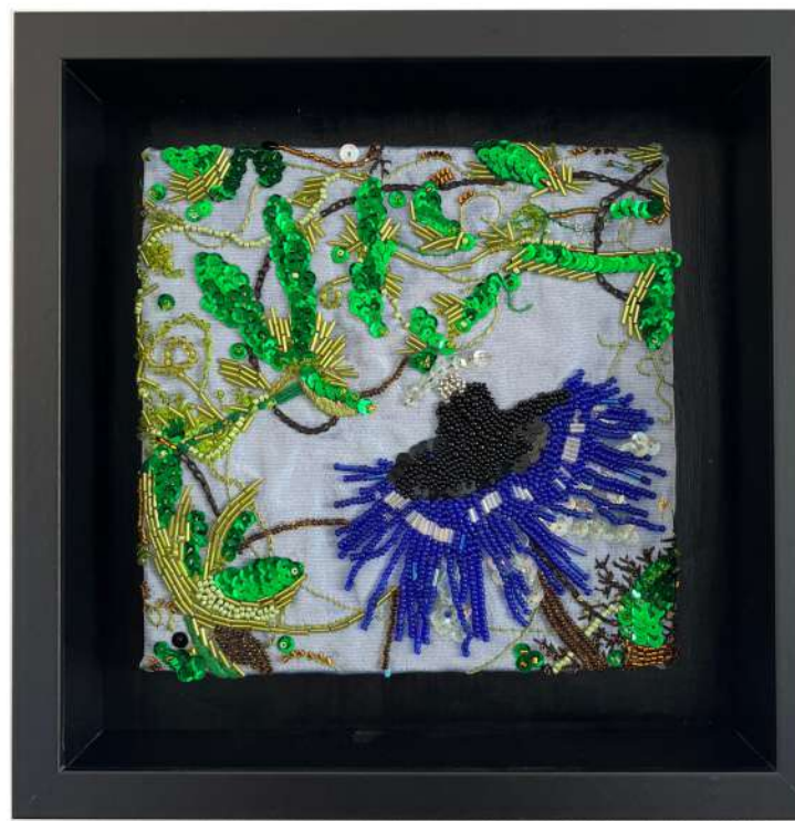
Eden - 2023