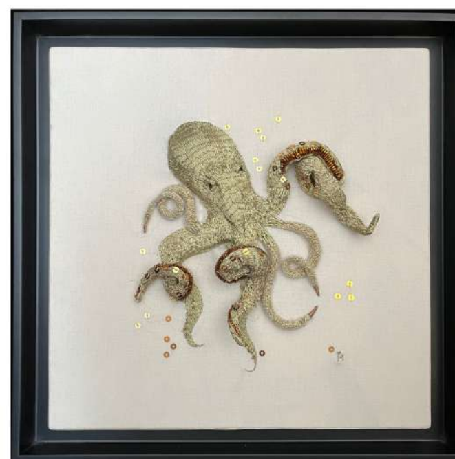
Octopuss- 2023 / Gold et Copper

12x9cm - satin, polyester, glass pearls, sequins