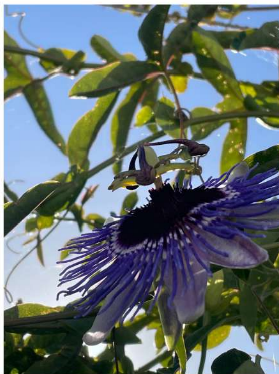
fleur de la passion - 2023

Charmed by the works of artists whose work I love, I create mirrored embroideries with their permission. It's a kind of artistic "four hands" combining homage and technical challenges.