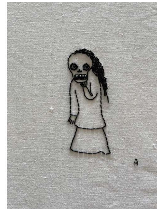
Adolescence - 2024