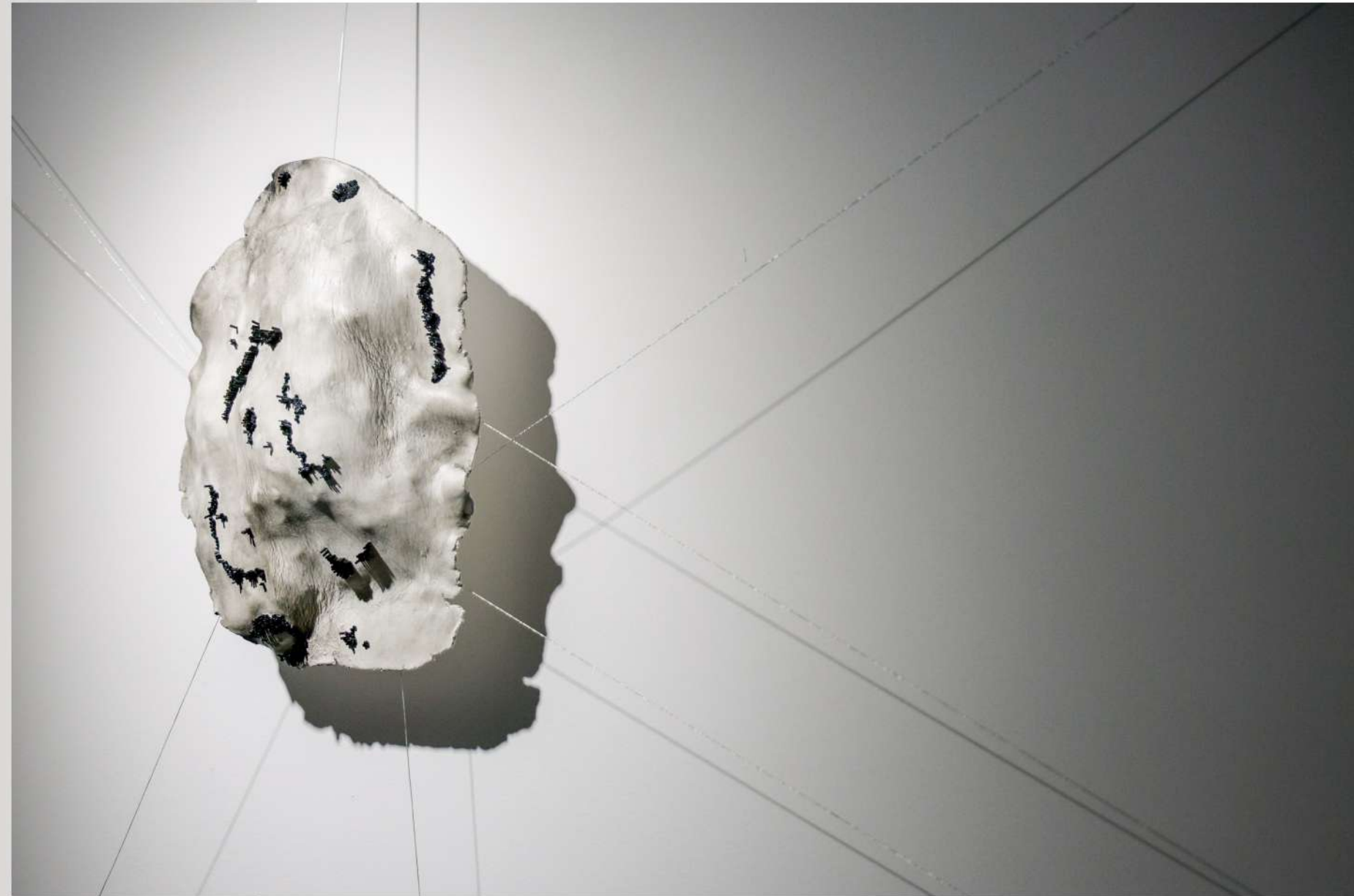
Sea bones (G) - 2024

Triangular Tower gallery Archeologic museum of Sofia