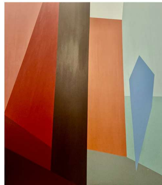
Horizon - 2021